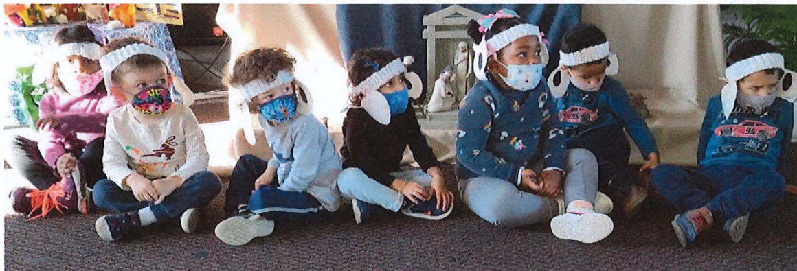
3's at rehearsal.