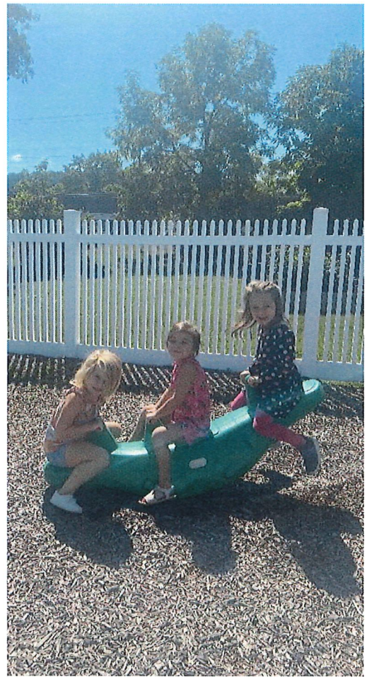
This week at Thorndale Learning Center