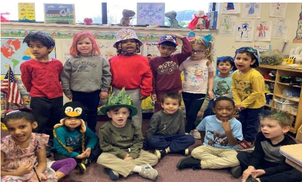
Our Pre-K class with crazy hair and hats!