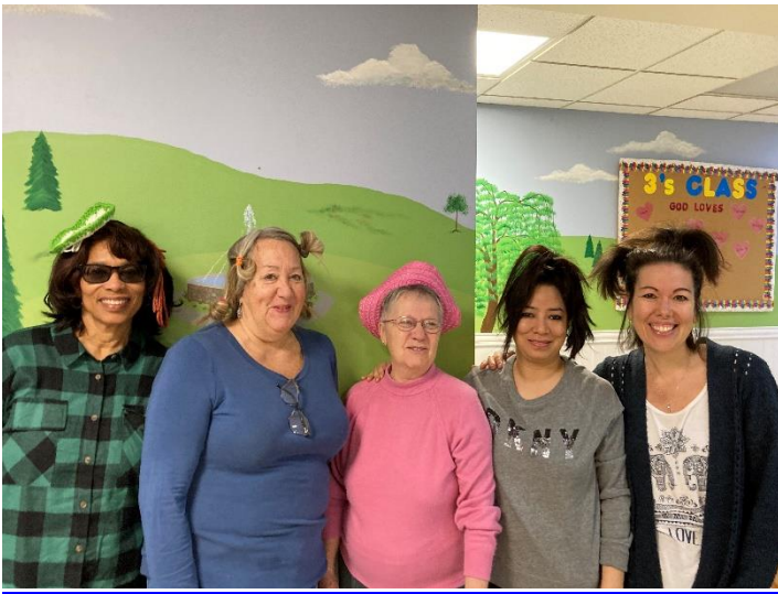
Our wonderful staff for crazy hat/hair day.